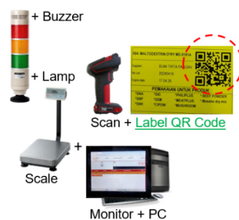
Figure 2. QR Code System to Prevent Recipe or Material Errors

Based on Figure 1. House of Quality, the results of the Focus Group Discussion (FGD) involving nine technical experts, each identified Design Parameter (DP) was further analyzed to establish clear and applicable technical constraints. For example, DP1 regarding the monitor was translated into a minimum size constraint of 10 inches to ensure information is easily visible, while DP2 regarding the scanner specified the use of a dedicated QR Code scanner to ensure scanning accuracy. Visual and audio alarms (DP3 & DP4) were adjusted according to red, yellow, and green lights and a buzzer alarm, while the data storage and recording system (DP5) was set up with 6 PCs according to operational needs. The recipe guide interface (DP6) was implemented through an interactive interface, and the QR Code label quality (DP7) was ensured to be clear and adhesive. The number of weighing scales and spare scanners (DP8 & DP9) was set according to requirements, the user login system with authorization levels (DP10) ensured security, the material layout and scanner storage location (DP11 & DP12) were designed ergonomically, and the material type and weight detection system (DP13 & DP14) ensured accurate compliance in the weighing process.