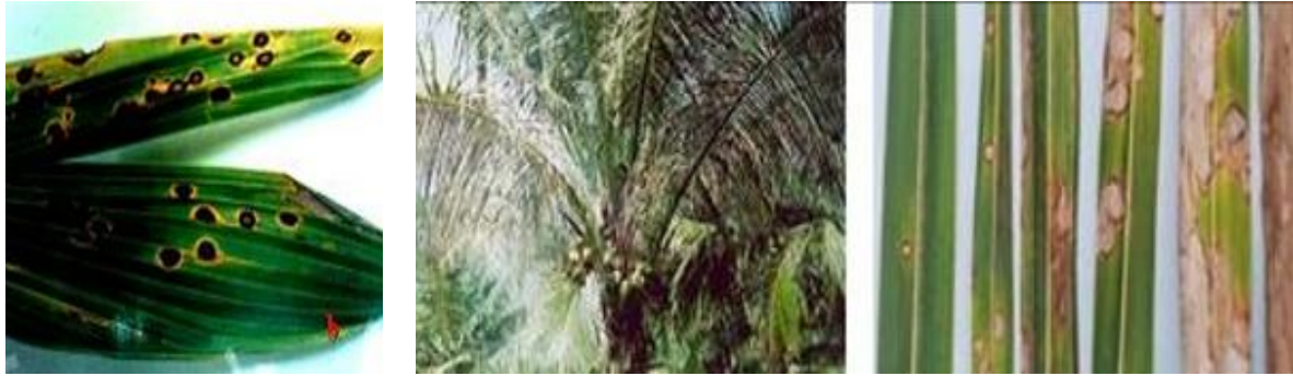
Figure 4. Symptoms of Pestalotia palmarum attack on the leaves of hybrid coconut seedlings (left) [1], Symptoms of severe attack of Bipolaris incurvata on hybrid coconut canopy (right) [1]