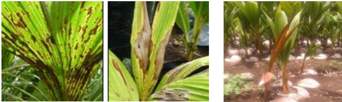
Figure 5. Symptoms of Colletotrichum sp. attack and Culvularia sp. on hybrid coconut seedlings (left) [1], Symptoms of Dry Blight attack on hybrid coconut seedlings (right) [1]