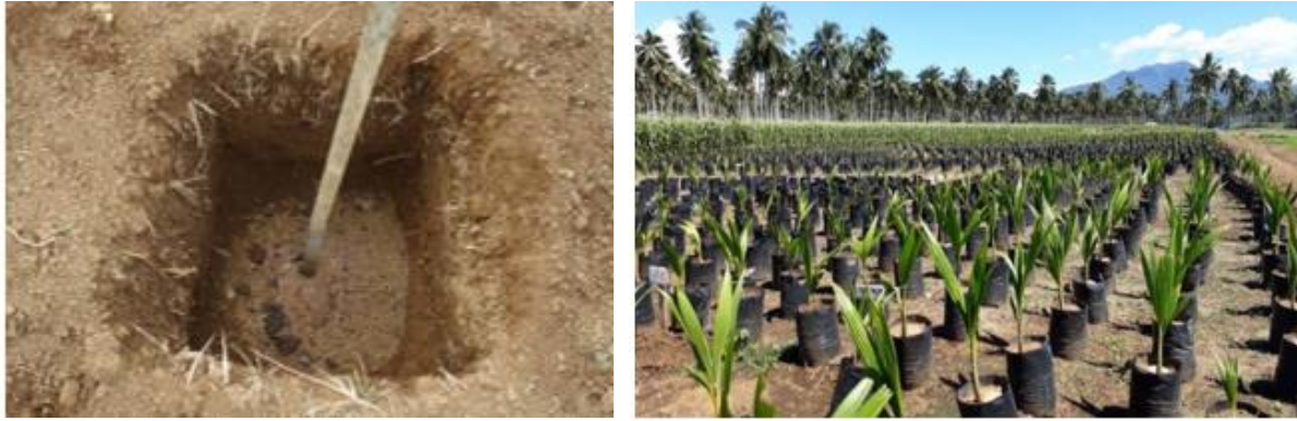
Figure 2. Illustration Hybrid coconut tree planting hole 70 x 70 x 70 cm (left), Illustration of Hybrid Coconut Seedlings Ready for Planting (right)