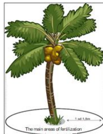
Figure 3. Weeding hybrid coconut tree plants (left) [1], Illustration of Fertilization Area (right) [1]