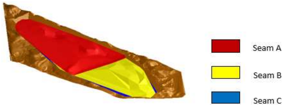
Figure 2. The modeled coal resource

From the drilling carried out as many as \pm 199 points with the spacing between drill holes ranging from 50 - 100 m, the drill hole data used in this study was 107 points based on the results of data processing that the researchers determined based on the prospect area boundaries that had been determined previously [1]. The drilling, survey, and coal quality data are processed, analyzed, and then re-evaluated to determine the number of seams, rock stratigraphic sequences, and coal distribution. The results of this evaluation are then processed using software to determine the geological model. The ultimate goal of this evaluation is to determine the number of coal resources and measured resources with a stripping ratio to be followed up towards mining [3].