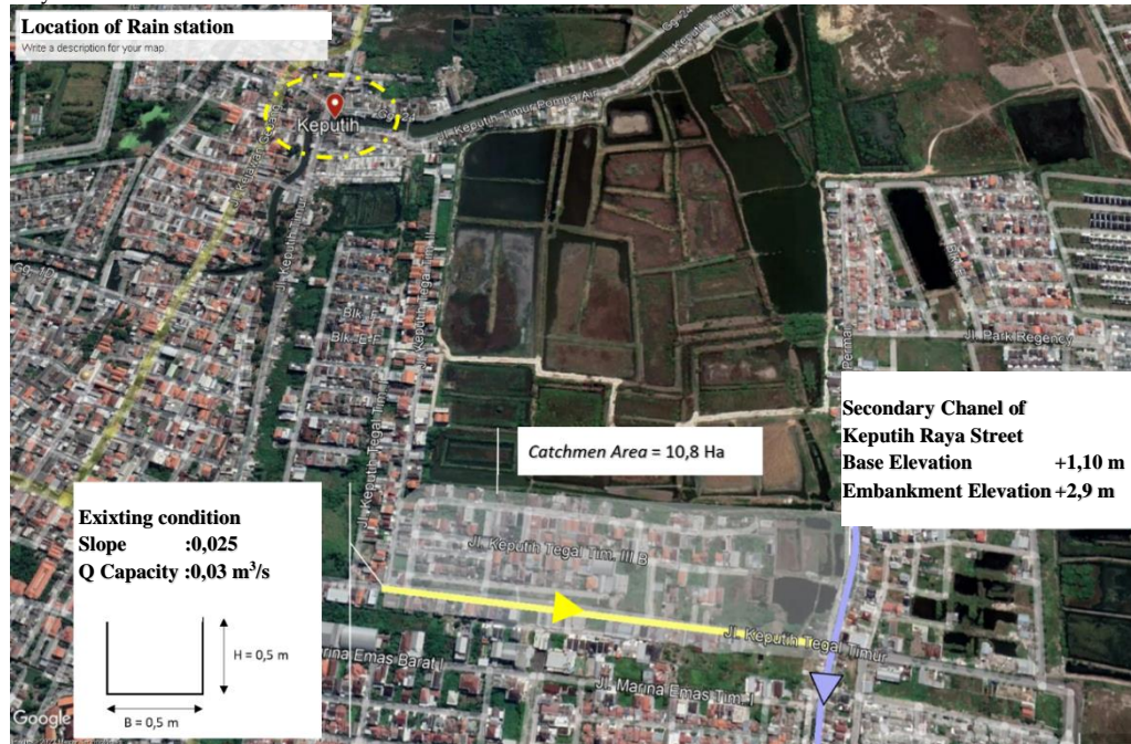
Fig. 1 Keputih Tegal channel drainage scheme and Rain Station influential

Based on the map of the distribution of rain stations and study locations, it was found that the influential rain station for hydrological analysis in the Jalan Keputih Tegal area was Keputih Rain Station. So, for the next analysis will be used data for 10 years from the rain station.