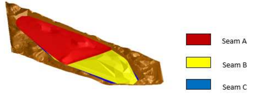
Figure 2. The modeled coal resource

From the drilling carried out as many as \pm 199 points with the spacing between drill holes ranging from 50 - 100 m, the drill hole data used in this study was 107 points based on the results of data processing that the researchers determined based on the prospect area boundaries that had been determined previously [1]. The drilling, survey, and coal quality data are processed, analyzed, and then re-evaluated to determine the number of seams, rock stratigraphic sequences, and coal distribution. The results of this evaluation are then processed using software to determine the geological model. The ultimate goal of this evaluation is to determine the number of coal resources and measured resources with a stripping ratio to be followed up towards mining [3].