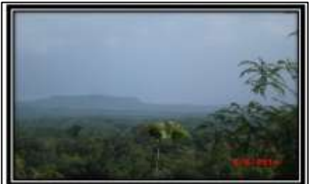
Figure 2. Photo of the Form of Anticline Form in the East-Southeast - Northwest (N-S), Direction of Camera to the South.

The anticline in the research area was formed towards the West - East. The shape of the morphology in the study area also shows the bumpy hills that are covered by soild (alluvial) very thick. The morphological shape around (outside) the study area also shows the rolling hills (fig. 4.7) and regionally shows that the spread of anticline extends from the East - West direction.