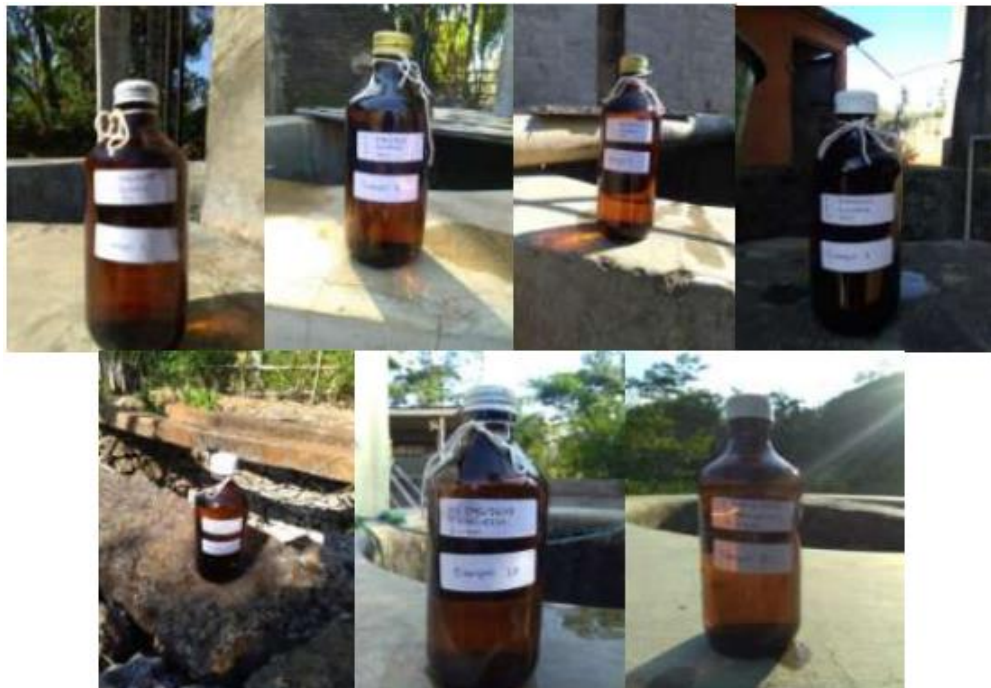
Picture 2. Sampling Test Biological Parameter